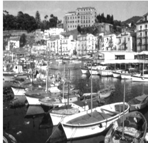
Beautiful Sorrento Harbor

All rates are per person, twin occupancy, plus $434.85 in departure taxes and fees, and a Fuel Surcharge (subject to change).