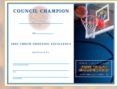
Council Champion Certificate (#1809)