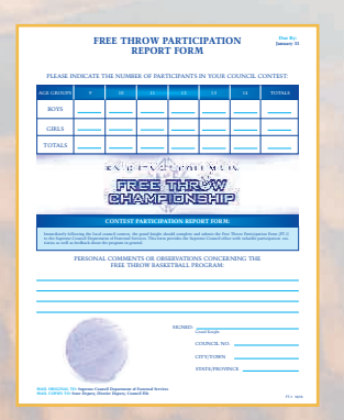
Free Throw Championship Participation Report Form (#FT-1)