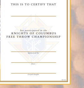
Participation Certificate (#1597)